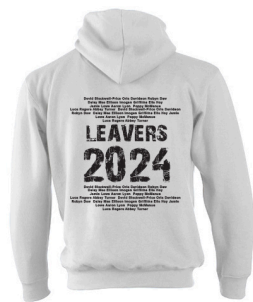
24 Leavers B