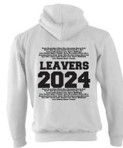
24 Leavers A