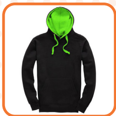
Black/ Neon Green