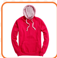
Fuschia/ Baby Pink