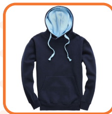
Navy/ Powder Blue