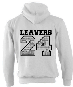
24 College Border