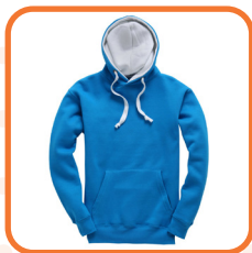
Electric Blue/ White