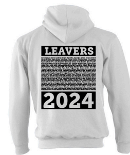
24 Leavers K