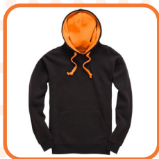
Black/ Neon Orange